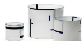
Cylinders by Bodil Manz from New Century Modern exhibition

Stirrup Vessel #9605 by Chris Gustin from Altered Earth exhibition