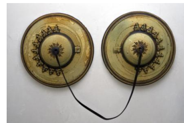
Soundless by Vineet Kacker from Evolving Traditions exhibition

A full listing of all the exhibitions on view as part of the 2013 NCECA conference is available at the end of this press release and online at http://nceca.net/static/documents/ShuttleTours2013.pdf . Exhibition information will also be included in the NCECA Exhibitions Guide printed by Ceramics Monthly and will be posted on the conference mobile device app, which is still being developed.