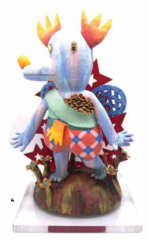
4 CHANAKARN SEMACHAI, I Cry Rain, 2021, Stoneware, underglaze, glaze, luster, plexiglass, Cone 04 oxidation-fired, 12" x 18" x 10", Photo credit: Chanakarn Semachai