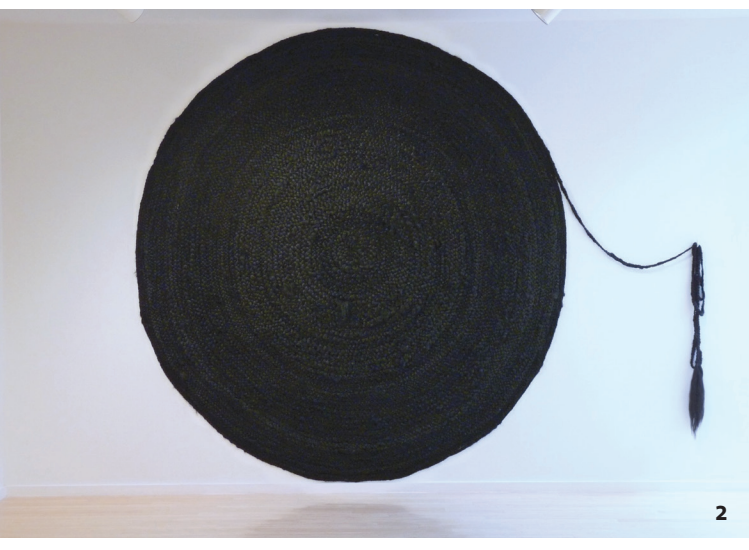
\textbf{2} \, \textbf{AKIKO JACKSON}, \textit{Heritage Braid}, \textbf{2007-present}, \textbf{Synthetic hair and metal fasteners}