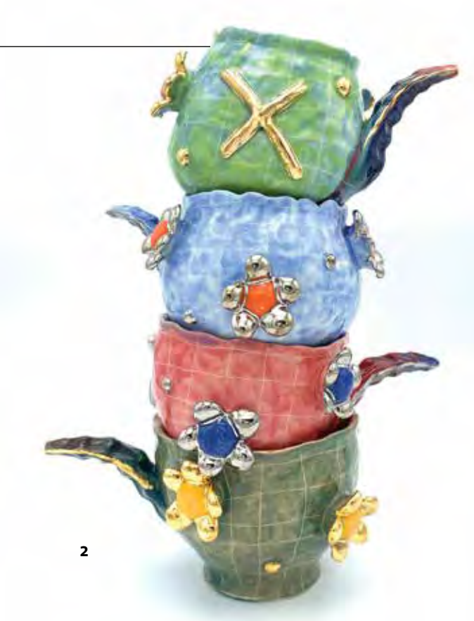
2 CHANAKARN SEMACHAI, Something, Something a Day Makes a Dogtor Come 'n' Play!, 2019, Stoneware, underglaze, glaze, luster, nichrome wire, plexiglass Cone 04 oxidation-fired, 28" x 19"x 21", Photo credit: Chanakarn Semachai