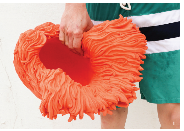
1 OWIST JOSEPH. Dowsing For Before, 2019. Digital image