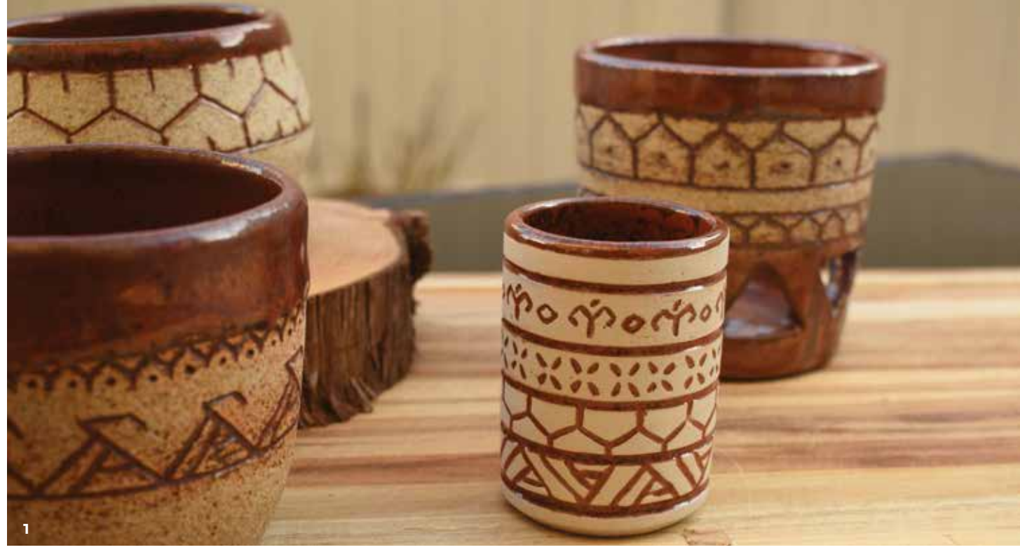
1 Cone 10 reduction with Mishima inlay

The changeover from a rolled broad-leaf as a container, or a bamboo tube as a cooking vessel, to the compounded problem of pot-making is analogous to the transition from the use of mechanical to nuclear energy.